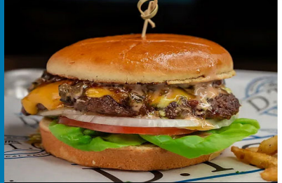
MON $11.99 Smash Burger