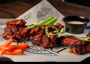
$11.99 Trifecta Wings